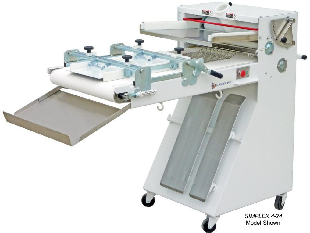
SIMPLEX 4-24 Model Shown