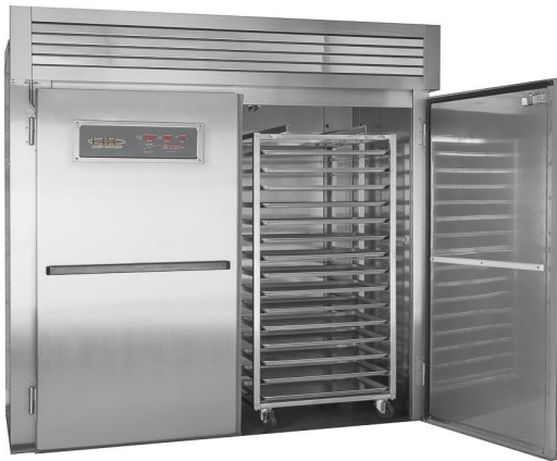
Model LRPR3-30HO Shown (rack not included)