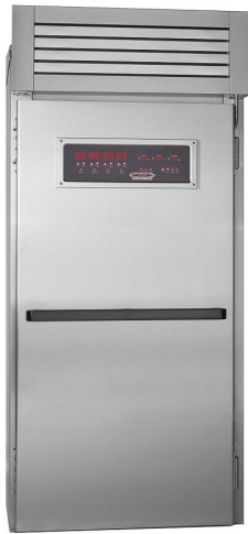
Model LRP1-40 Shown