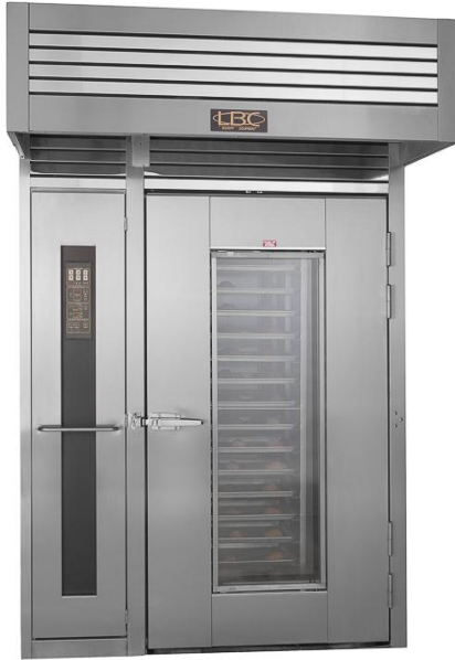
Model LRO-1E4 Shown (Rack not included)